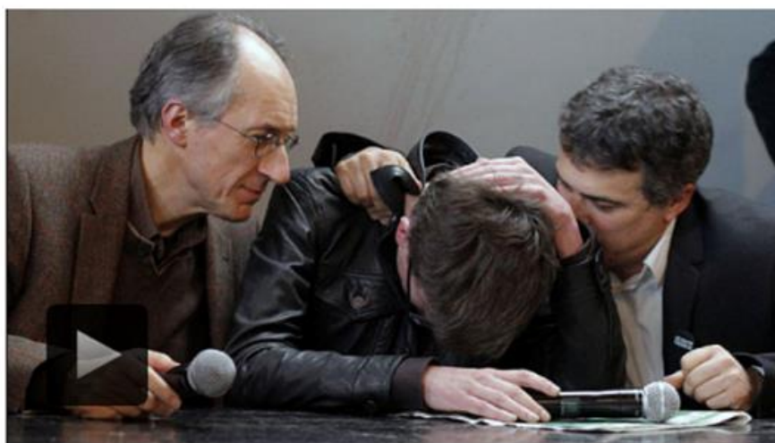
Image 2