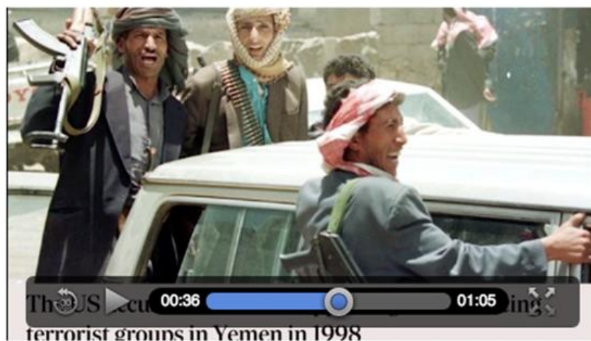
Image 1: Video still, Telegraph (Telegraph Media Group Limited 2015)

The Abu Hamza video is in binary opposition to the Charlie Hebdo video where the use of the crying cartoonist shows the emotion or humanness of the West, expressed in the cartoonist and his creation of 'I am Charlie' connoting 'we are all Charlie'. The cartoonist Renald Luzier discusses forgiving the attackers while being visibly upset. This display of vulnerability and emotion reinforces the 'enlightened West', ready to forgive discourse by in contrast with the intertextuality of Abu Hamza 'Captain Hook'. Hamza is represented as what the left have permitted Muslims to 'do' in the UK, fostering 'primitive' practices such as segregation in schools.