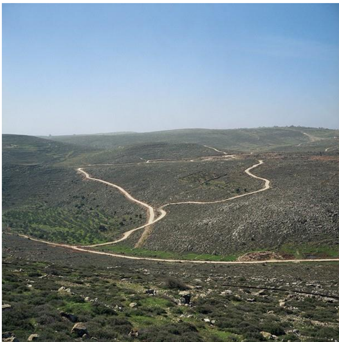
Figure 3: Gaston Ickowicz – Illegal settlement routes (2005)

argued, is by definition hard to represent. Moreover, because those that the slow violence affects often lack any means or capacity to halt its spread, they become a captive audience for this slow development. As a captive audience of the ongoing disaster and its expanding damage, the necessity to read both the disaster and its representation through the notion of time and space underpin the redolence of Israeli landscape photographer, Gaston Ickowicz's Gaza and West Bank landscape series, Settlements (2003-2006).