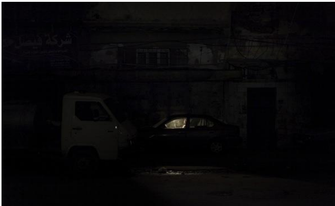
Figure 2: Gianluca Panella: 2013 A Gazan street, the only light is from the inside of a car.

Time and space, as Ariella Azoulay (2012) has pointed out, is required for the fabrication of an outbreak of violence. Disasters, she writes, 'do not usually break out' – rather they exist and persist, below the threshold of perceptibility. Unlike disaster par excellence, the spectacular event that besieges a city or a community, regime-made disaster is an ongoing process that consistently impacts a defined part of the population under a regime that differentiates groups of citizens and non-citizens (Azoulay 2012, 126 or 30). For the inhabitants of Gaza, this is visible in their inability to move freely; however, the hidden impact of this mode of control, specifically upon their technological and communicative growth, conveys the asymmetric nature of the power dynamic in play (Tawil-Souri 2014). To make such a process visible, as I have