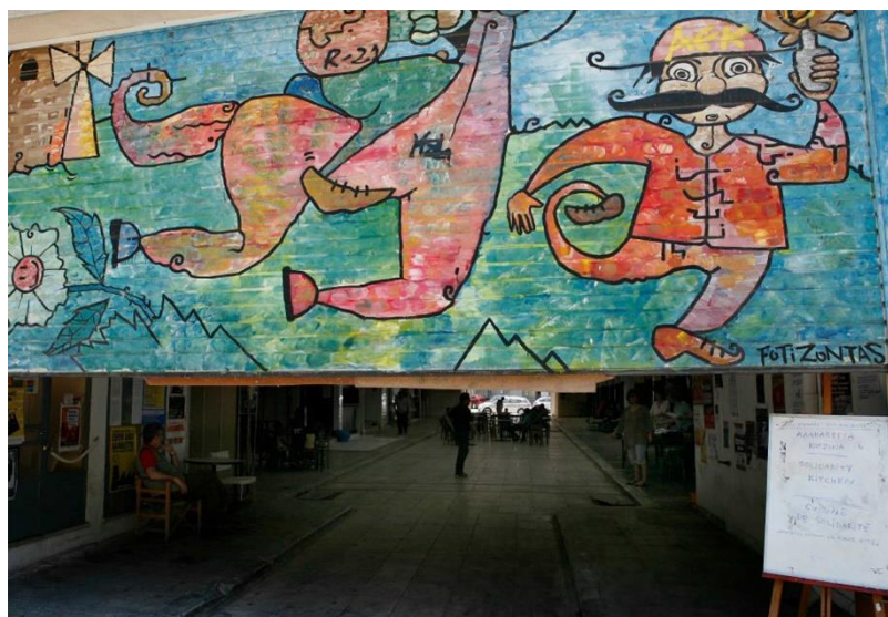
Photo 3: Kypseli Municipal Market operating as an inclusive public space, 2012

The migrant factor has also contributed significantly towards Kypseli’s density, as nowadays almost 65% of the neighbourhood’s population are immigrants. Prominent urban sociologist Robert Park (Robert E. Park et al. 1967) has been approaching cities’ large densities as a pathogenic factor of transgression that could limit – if not totally eradicate – practices of social