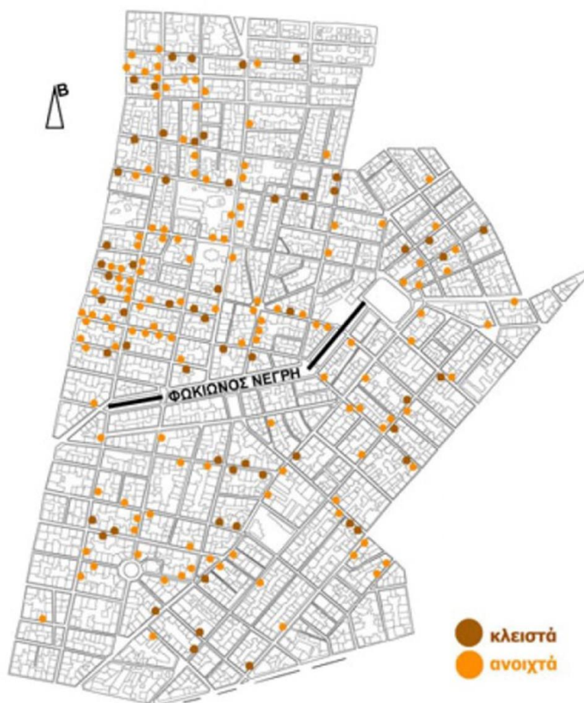
Figure 2a: Type and origin of businesses in Kypseli, run by immigrants. 10% of the neighbourhood's traders are immigrants. 56% of these services are primarily referred to immigrants, while 44% refer to a mixed clientele.