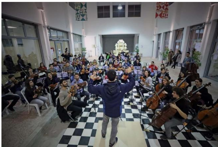
Photo 5: El Sistema Greece in concert, Kypseli Municipal Market, 2018.