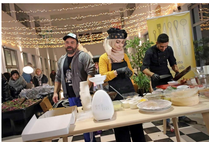
Photo 7: Street Food Party with the participation of ethnic cuisines, 2017.