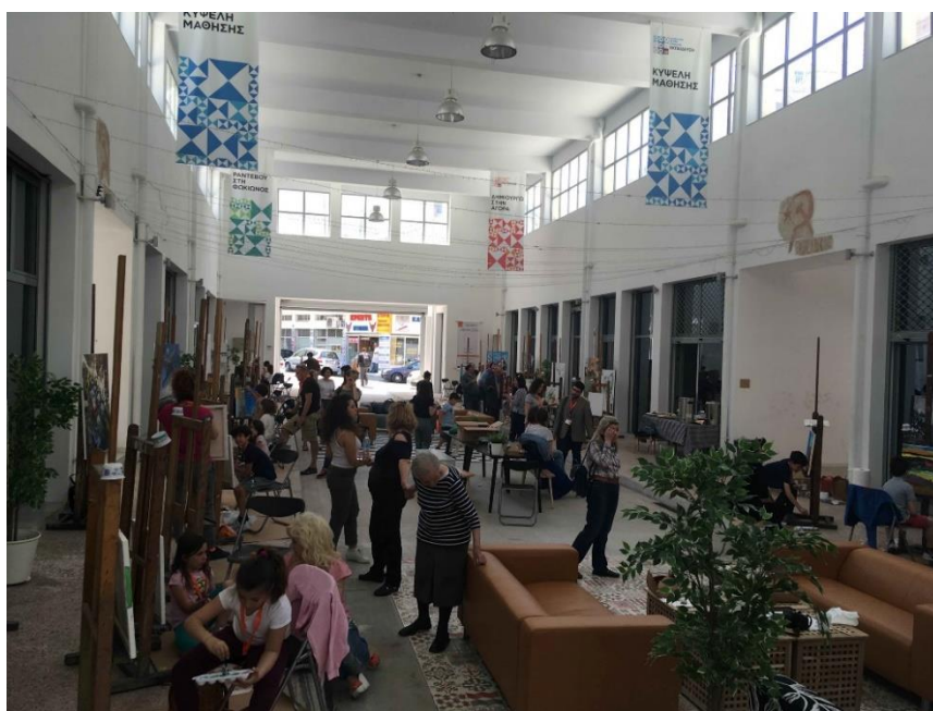
Photo 6: Painting workshops, arranged by CityLab and students of the School of Fine Arts, 2017