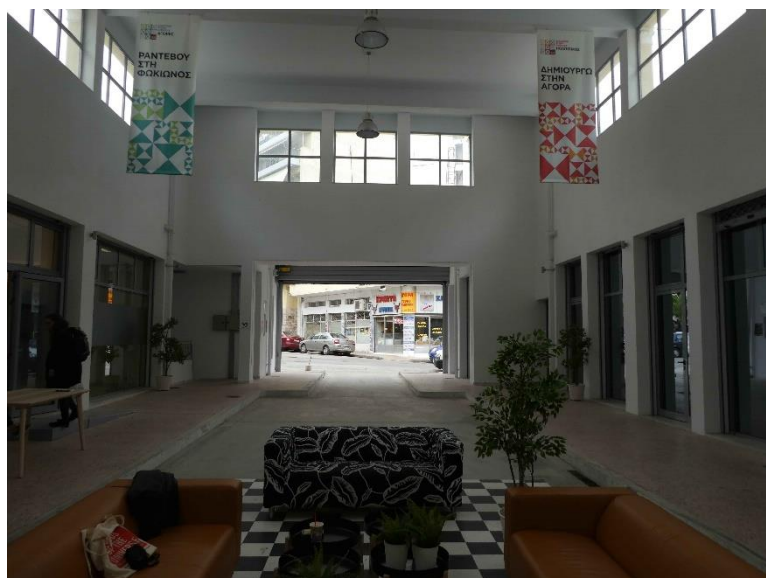
Photo 4: The renovated interior of the market, 2017

Apart from cultural provisions (exhibitions, music lessons run by El Sistema collective 20 and photography workshops) that are accessible to every citizen, Impact Hub has proclaimed an open competition to collectives and innovative bodies in order to re-establish the ‘commercial’ character of the market, adjusted to the project’s social character and in accordance with practices of mutual co-operation, social entrepreneurship and ethical trade. From the total of 30 submitted proposals, Impact Hub accepted eight to use designated spaces within the market. All of the participants are collectives of social entrepreneurship (koin.se.p) 21 , each specialized in a different field (provision of local products, social flower shop, products of biological cultivation etc.). Furthermore, the market attracts the general public as it is a safe and inviting environment that functions not only as a communal space for discussions, bazaars or exhibitions but also as a transitional space.