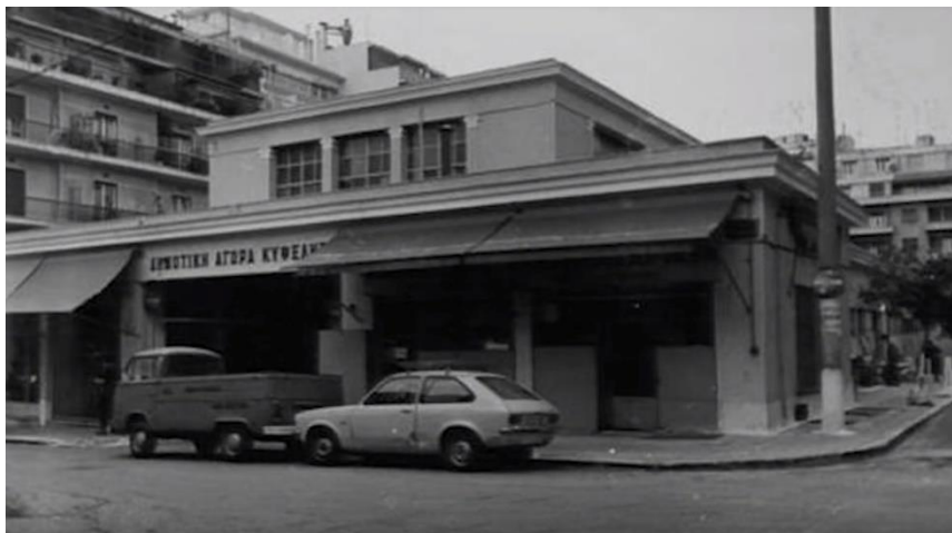
Photo 1: Kypseli Municipal Market circa 1980

During 1980s, the market's role degraded as many supermarkets emerged in the neighbourhood and local independent traders could not financially withstand the competition. Up until 2000, the market was underfunctioning and eventually the last shop closed down in 2003 along with the market itself. The municipality attempted to demolish the building in 2005 in order to construct an office complex that would include underground parking and a small-scale shopping centre. Many local citizens, including renowned artists and intellectuals, opposed the scheme and eventually the market was listed by the state.