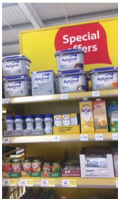
Figure 2: Evidence of Code breaking through promotion of first stage substitute milk at POS in images posted by a UK-based Facebook group members

and a way of changing the contents of its page, bringing to public awareness the possibility of breaking the law.