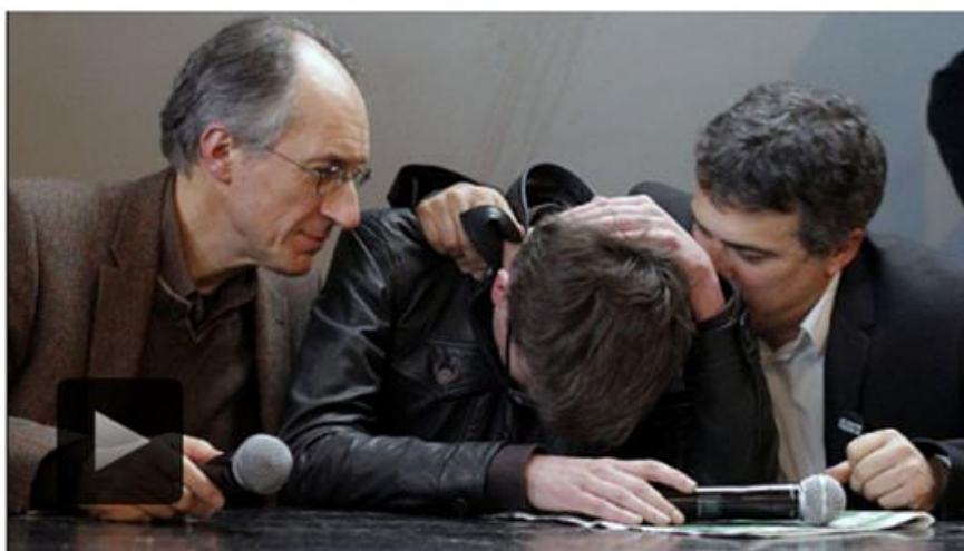
Image 2