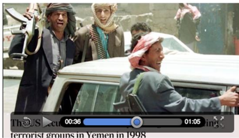
Image 1: Video still, Telegraph (Telegraph Media Group Limited 2015)

The Abu Hamza video is in binary opposition to the Charlie Hebdo video where the use of the crying cartoonist shows the emotion or humanness of the West, expressed in the cartoonist and his creation of 'I am Charlie' connoting 'we are all Charlie'. The cartoonist Renald Luzier discusses forgiving the attackers while being visibly upset. This display of vulnerability and emotion reinforces the 'enlightened West', ready to forgive discourse by in contrast with the intertextuality of Abu Hamza 'Captain Hook'. Hamza is represented as what the left have permitted Muslims to 'do' in the UK, fostering 'primitive' practices such as segregation in schools.