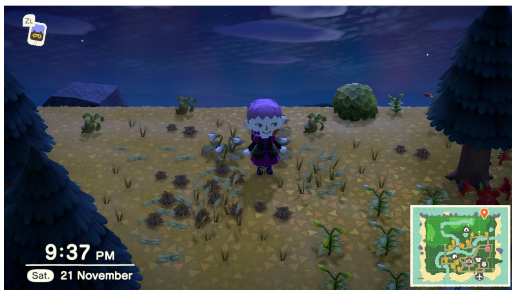
Figure 1: Weeds in Animal Crossing: New Horizons (Nintendo 2020)

Lockdown, Animal Crossing , playbour, interpassivity, games