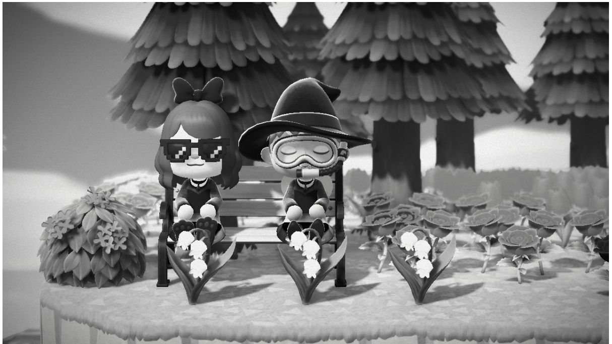
Figure 3: Waiting in Animal Crossing: New Horizons (Nintendo 2020) [Author's screenshot]